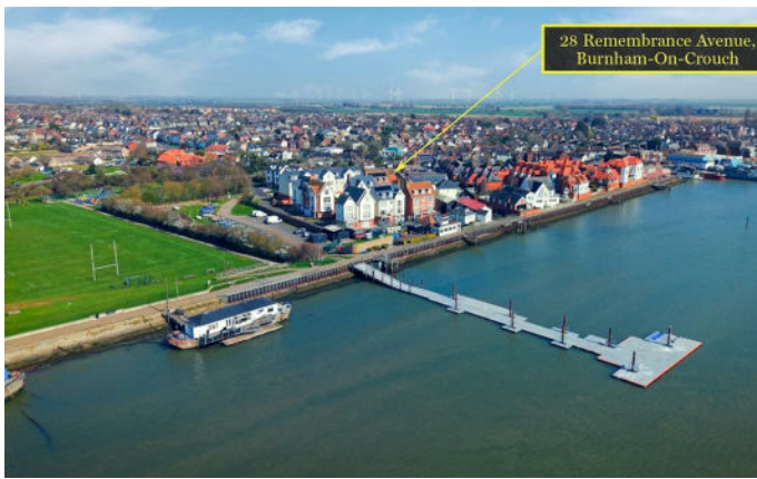
28 Remembrance Avenue, Burnham-On-Crouch