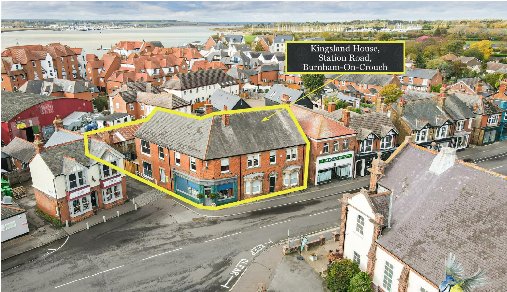
Kingsland House, Station Road, Burnham-On-Crouch

Station Road, Burnham-On-Crouch CM0 8HJ £895,000